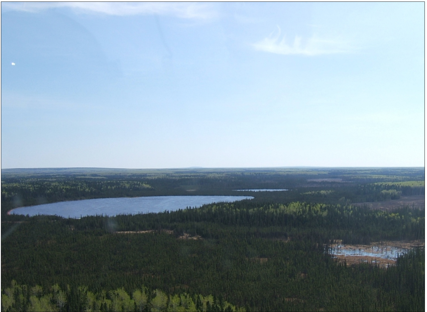
Horn River Basin

approved and used in each river basin is presented as a percentage of mean annual runoff.