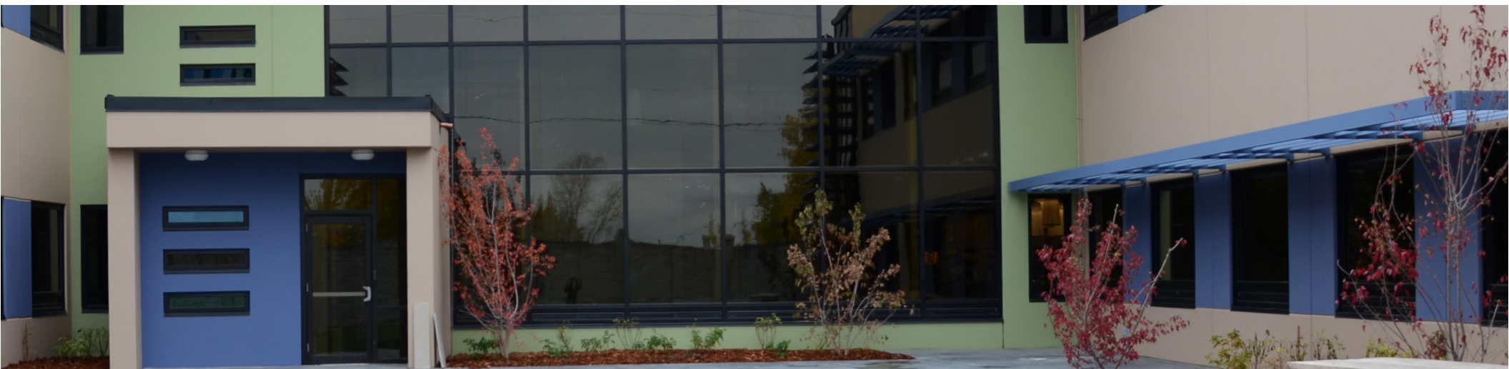
New Fort St. John Building

3. The third action taken is an effort to reduce paper consumption across the Commission. The Fort St. John office previously had 16 fax machines that printed upon receiving a fax. It now has four fax machines. These machines have now been streamlined and faxes go to an email inbox where they can then be forwarded to the recipient by email instead of printed. All promotional faxes can now be read and deleted instead of printed, therefore reducing paper consumption. This email fax system will also be put in place in Victoria this year.