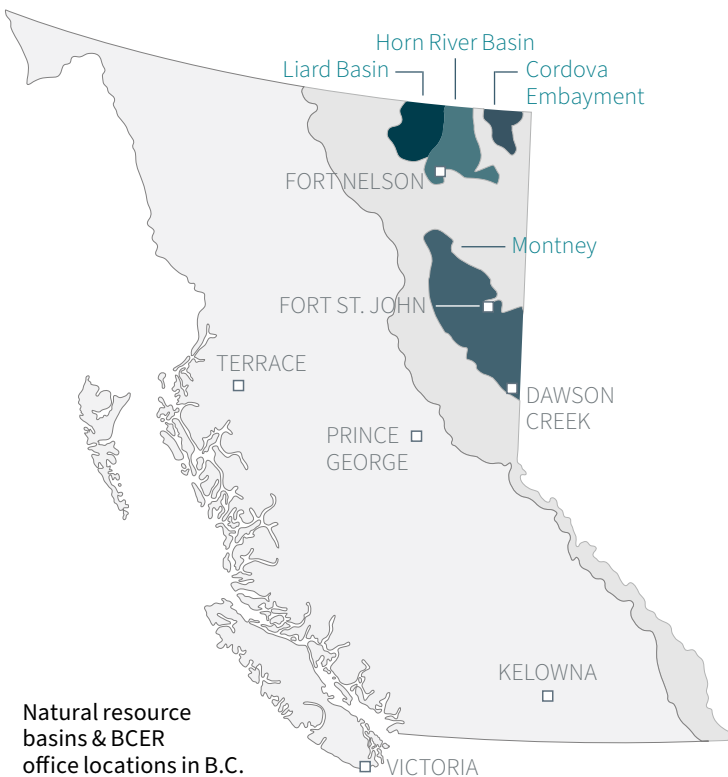
Natural resource basins & BCER office locations in B.C.

2023 marks the organization's 25th year of protecting public and environmental safety while balancing a broad range of stewardship, economic and social considerations.