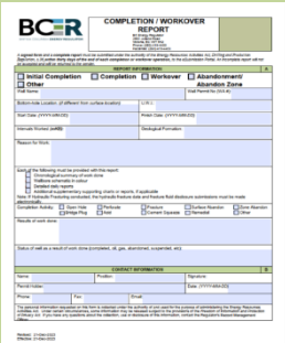
Completion /Workover Cover Page